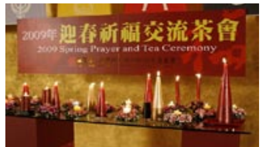
Pages 2-4: images from various interfaith events held here and around the world in the lead up to Melbourne 3-9 December 2009.